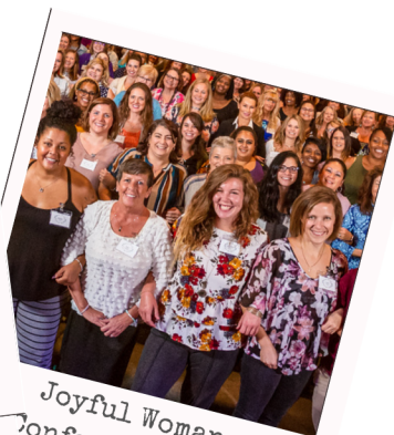
Joyful Woman Conference 2019