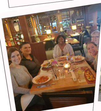
2021 Growth Gro